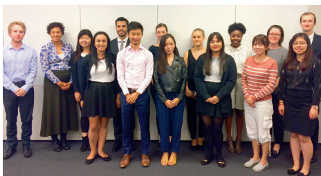
April 2018 volunteers advice line training