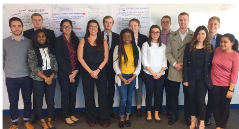
August 2017 Future Institute workplace skills training