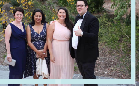
Enjoying the Piddington Ball September 2016.