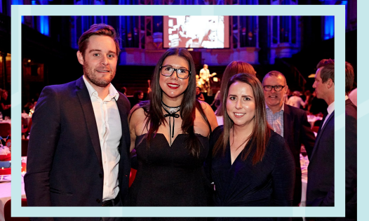
Celebrating at Sydney's Redfern Legal Centre 40th Birthday April 2017